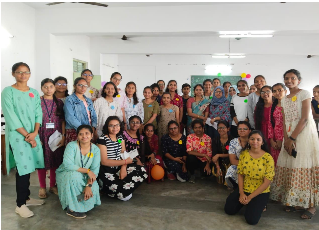
Poster Presentation faculty coordinators and participants.