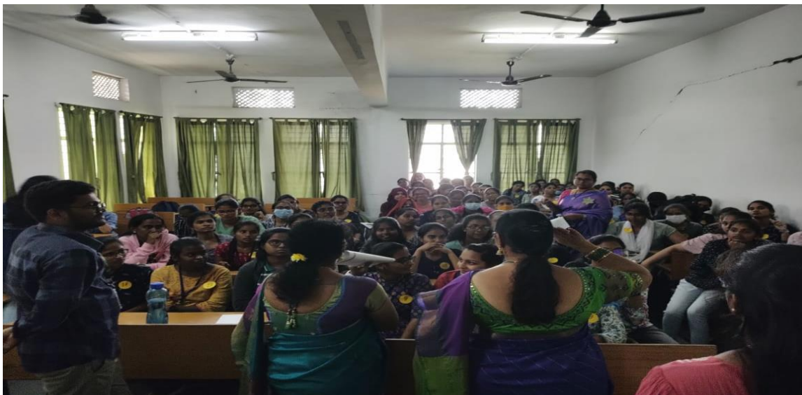
The coordinators explaining the treasure hunt instructions to participants.