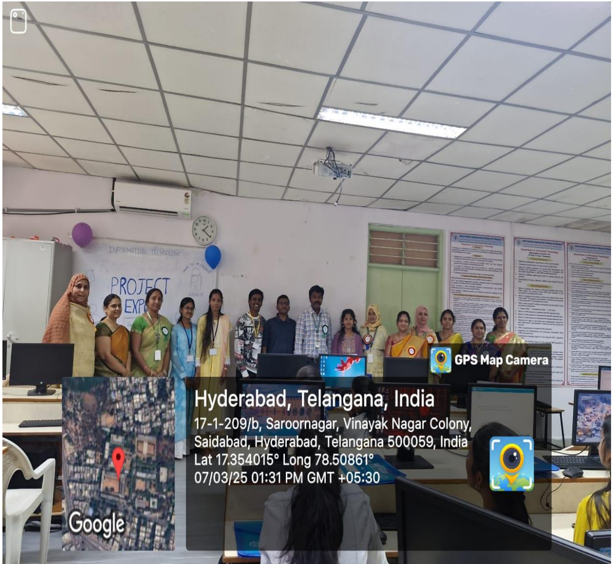
Coordinators, volunteers and winners