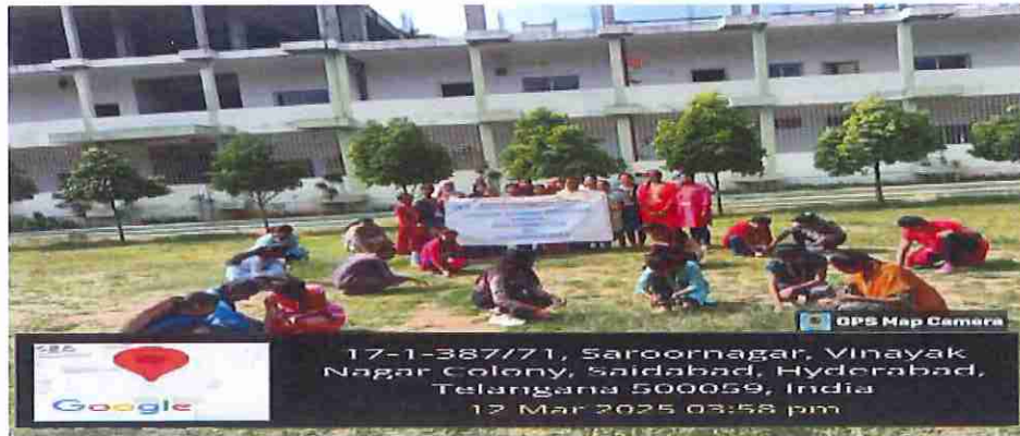
Swachh Bharat Program conducted at MH Gupta Girls High School on 12 March 2025

35 Student Volunteers were actively participated in this program and involved in the cleaning activity. They cleaned various areas within the school premises, ground, play area and other locations