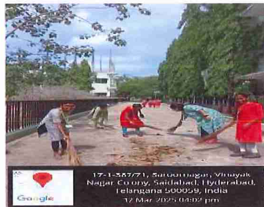
Swachh Bharat Program conducted at MH Gupta Girls High School on 12 March 2025