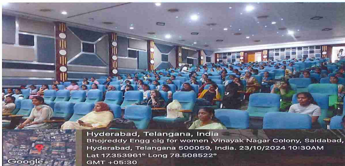
Breast Cancer Awareness Program on 23 October 2024 at RCC.

ECE, IT, EEE and CSE (AI&ML) the session was conducted at 11:30 am to 12:30 pm.