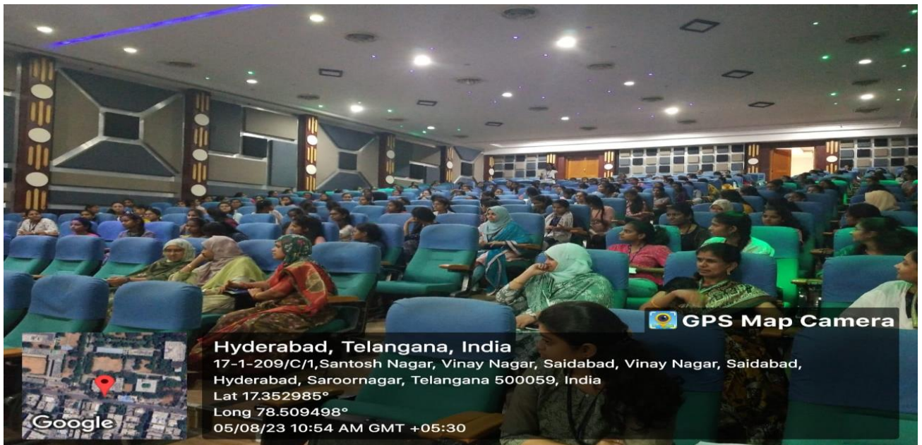
Figure 3: Faculty of IT and students of I, II year A and B section are seen attending the session.