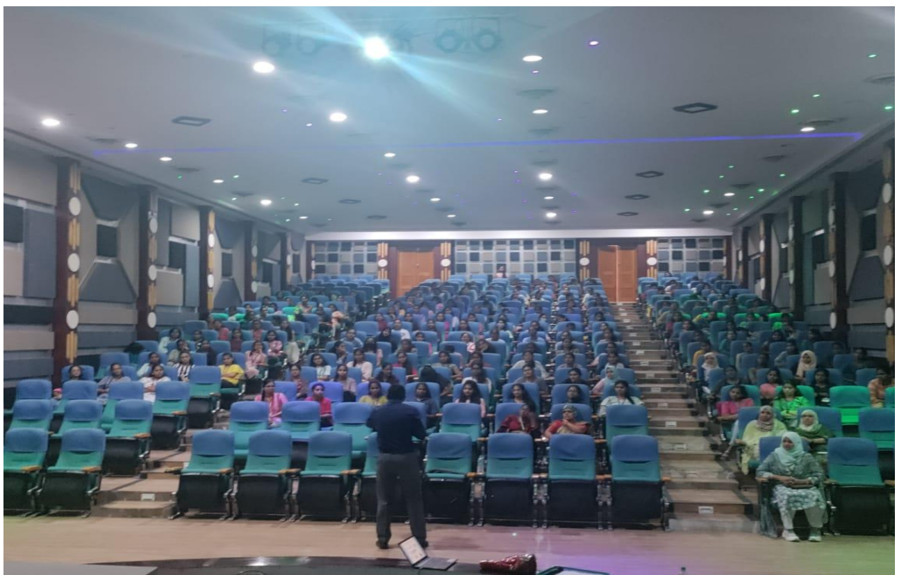
Figure 4: Audience