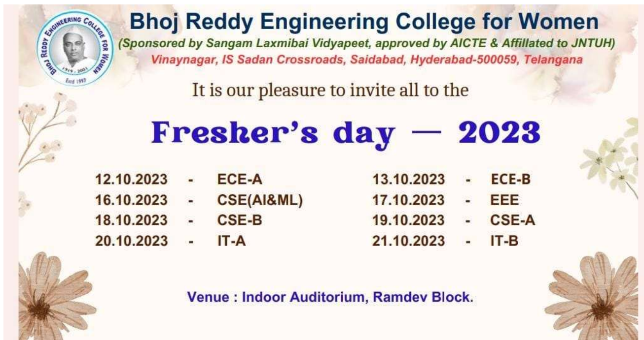
Figure 3: EEE Fresher's Day Banner