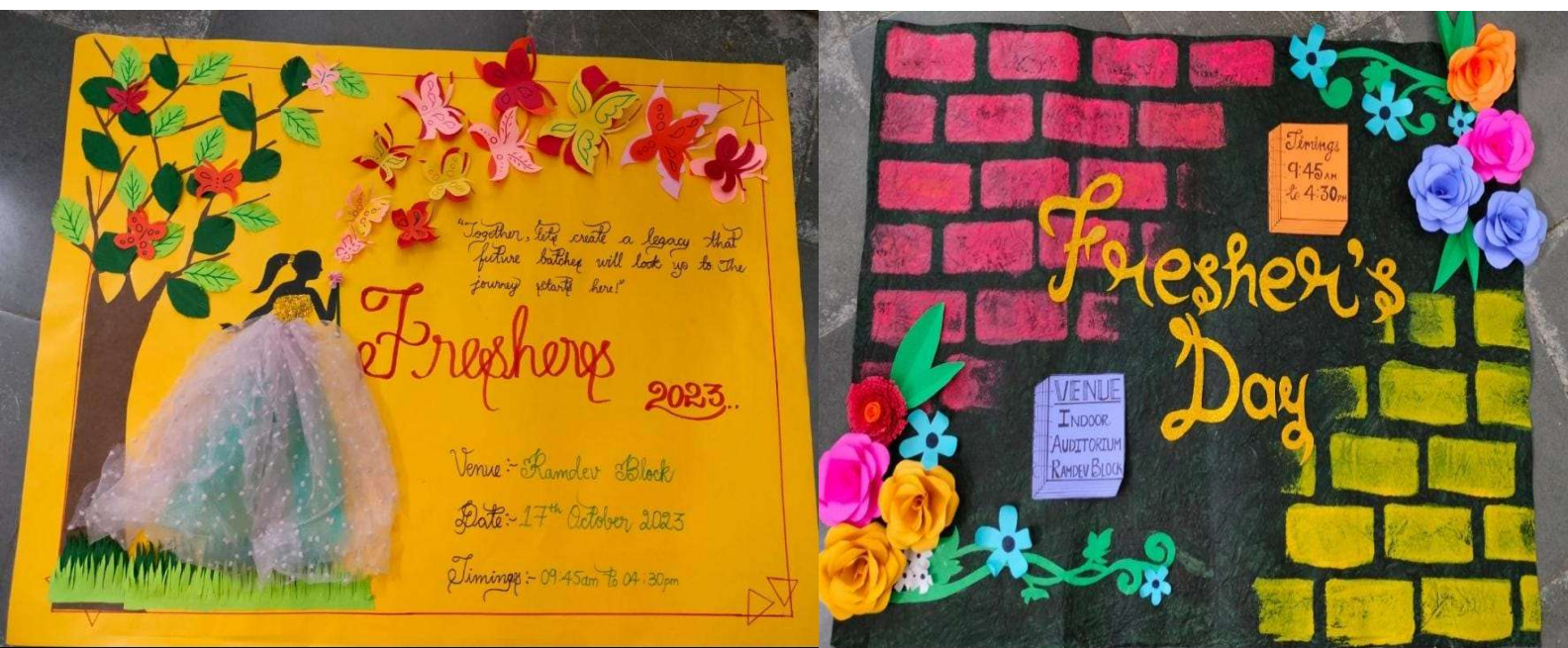
Figure 4: EEE Fresher's Day Handmade Posters