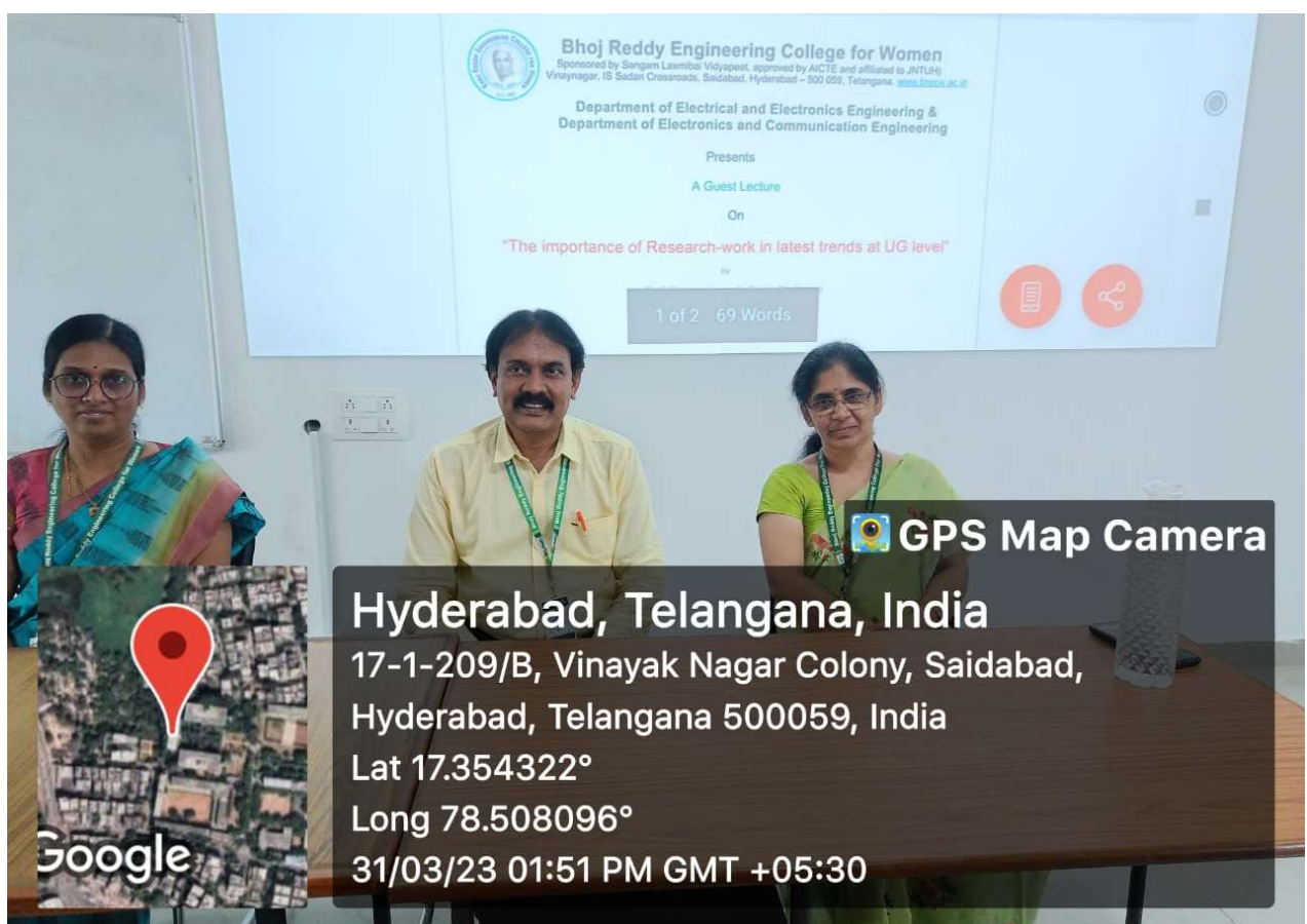
Figure 2: During the lecture of Dr B Raveendranadh Singh