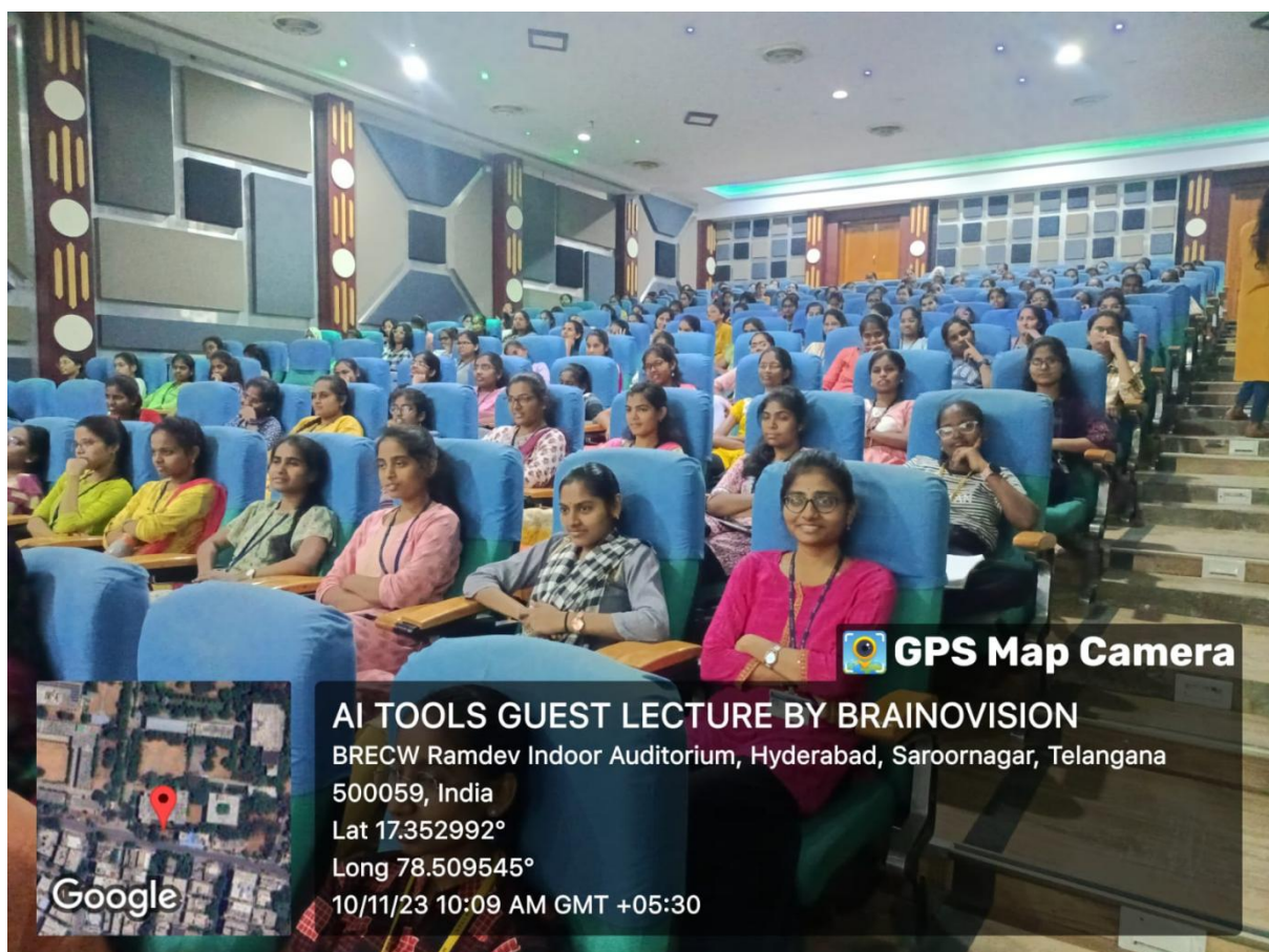
Figure 6: III CSE Students Attending the Guest Lecture

The lecture included live demonstrations and use cases for each tool, providing students with practical insights into how these AI technologies can be employed in real-world scenarios.