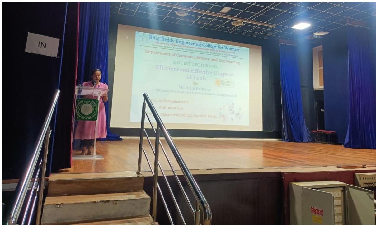
Figure 2: Welcome Address by III CSE Student Sankalpa