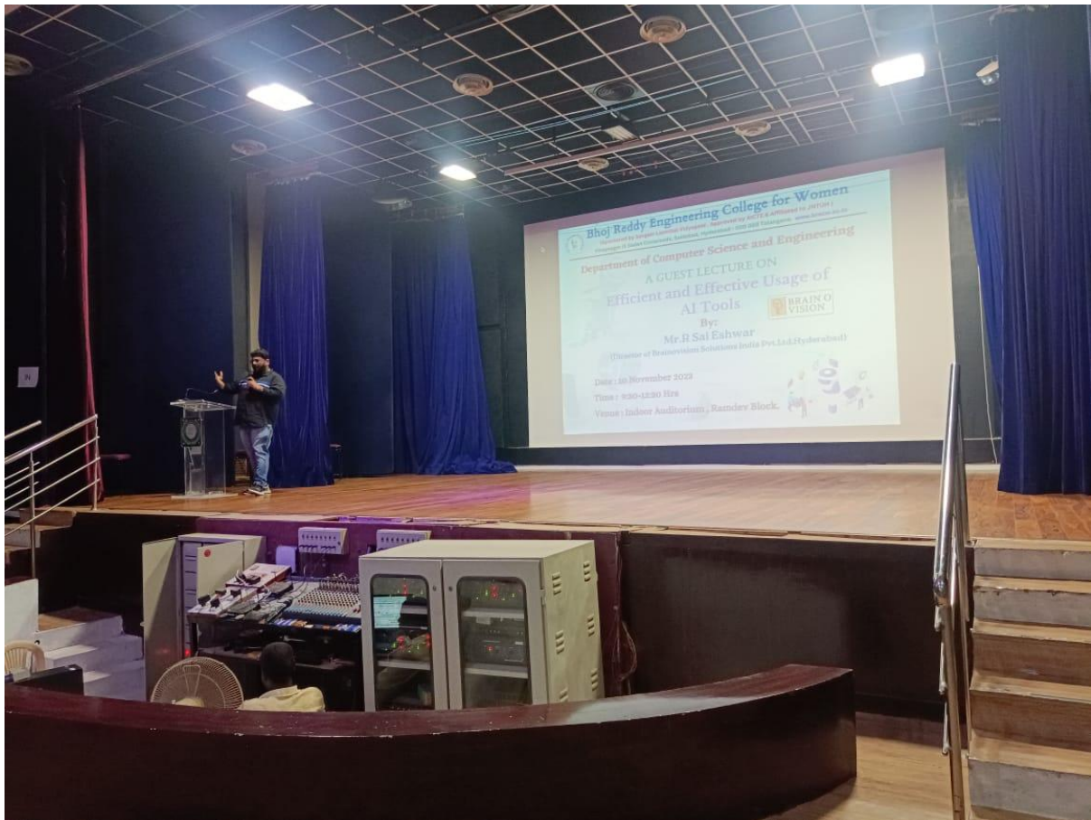
Figure 5: Mr R Sai Eshwar is addressing the III CSE Students

Midjourney: Explored the features and applications of Midjourney, emphasizing its role in data analytics and insights.