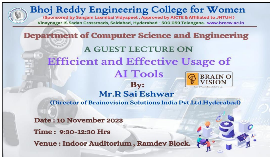
Figure 1: Banner of Efficient and Effective Usage of AI Tools

The CSE department has conducted Guest Lecture on “Efficient and Effective Usage of AI Tools” for III B Tech CSE A & B students on 10 November 2023. A total of 141 students attended the guest lecture. The guest lecture was scheduled from 09:30 to 12:30 Hrs. The guest lecture was conducted by Brainovision, Hyderabad.