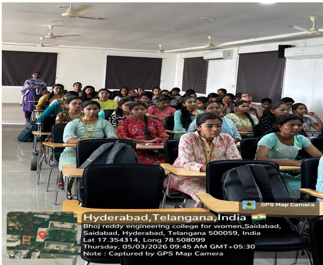
Figure 7: Students at the session

The sessions were interactive and engaging, allowing students to clarify doubts and explore various applications of Agentic AI in real-world scenarios.