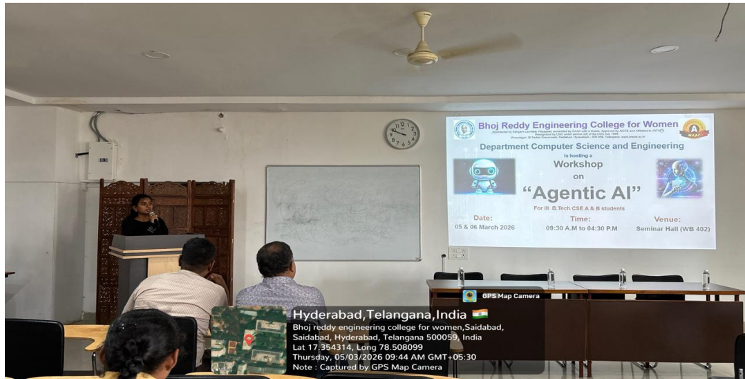
Figure 3: Welcome Address by a III B Tech CSE student

The session began with the Welcome Address by a III B Tech CSE student , who welcomed the dignitaries, the resource person, and all the participants.