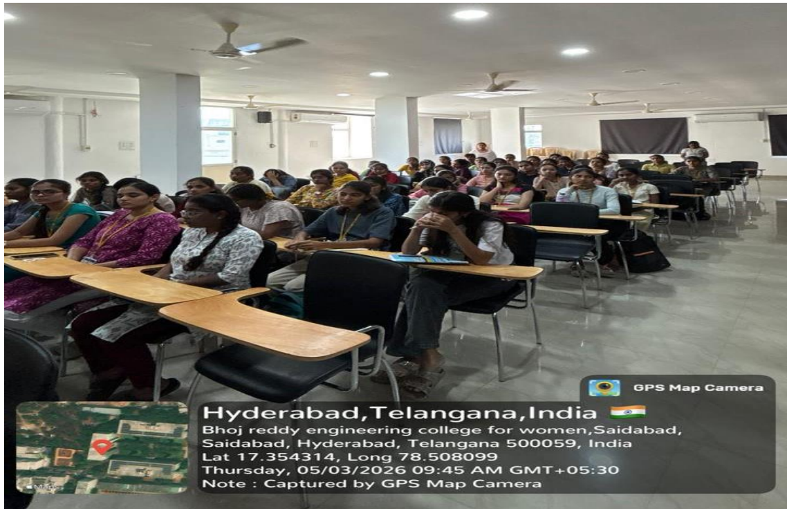
Figure 8: Students at the session