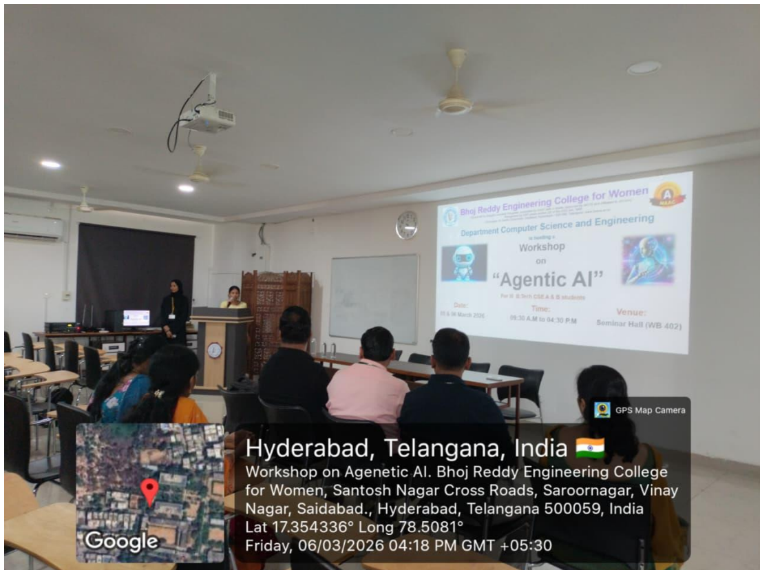
Figure 12: Student giving Feedback

Students expressed that the workshop provided valuable insights into emerging AI technologies, particularly the concept of Agentic AI and intelligent autonomous systems.