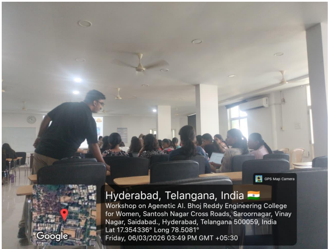
Figure 11: Resource Person explaining Students