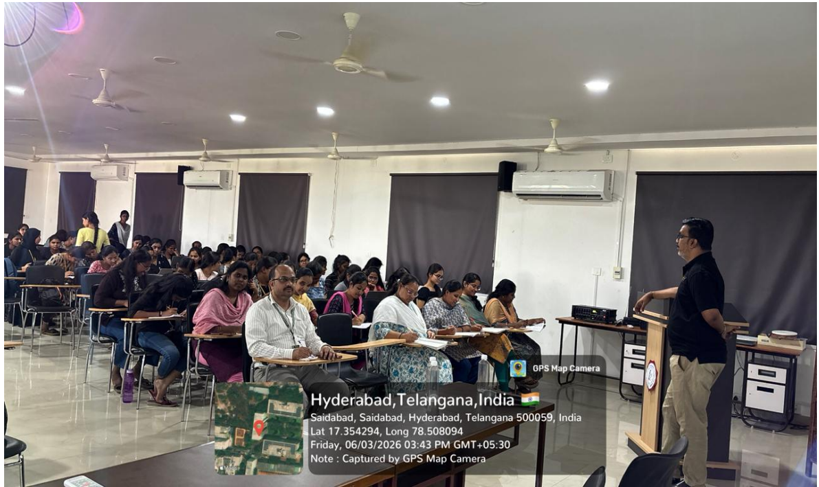
Figure 10: Staff and Students at the session