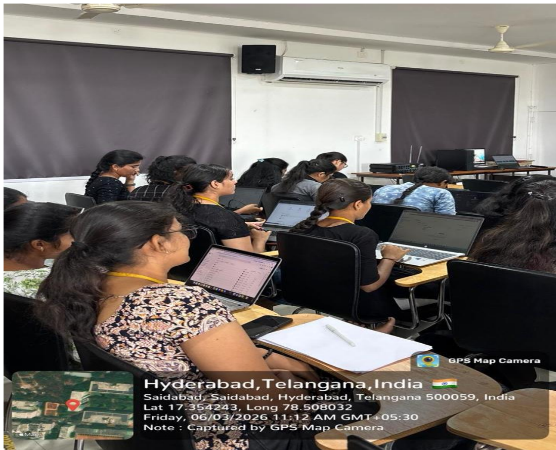
Figure 9: Students at the session